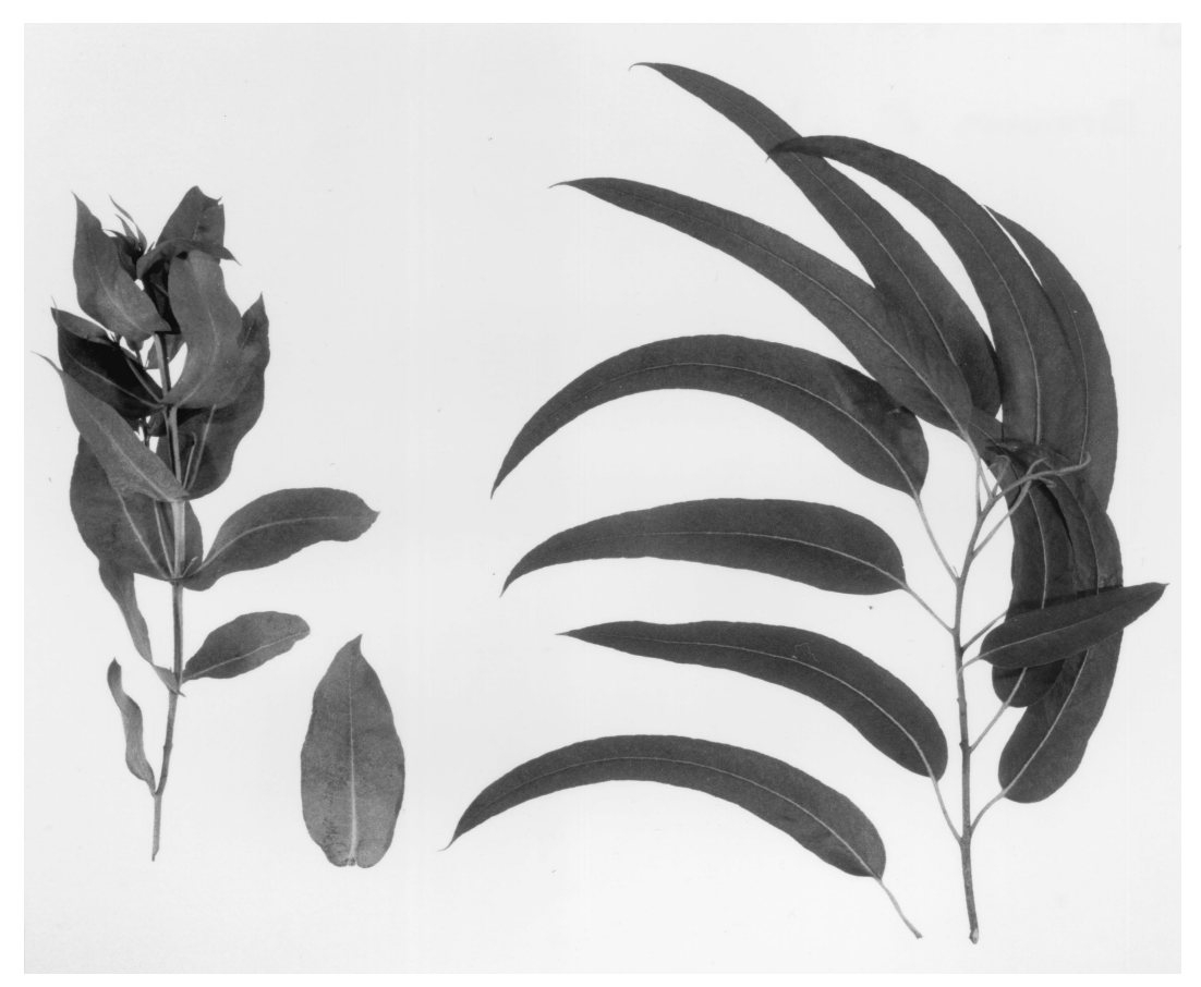
Fig. 1. Juvenile (left) and adult (right) shoots of Eucalyptus globulus.

on the lamina of expanding leaves. In California, E. globulus is a major host of the Ctenarytaina spp.